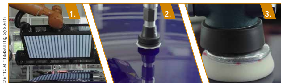
Example measuring system