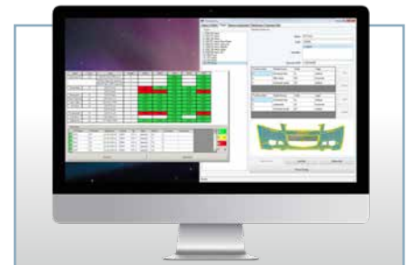
Simple statistics & process evaluation